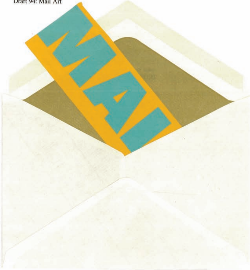
Draft 94: Mail Art

urce /fr/findresource /T/true /F/false /d/setdash /w/setlinewidth /J/setlinecap /j/se